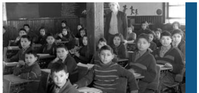
Cree students at their desks with their teacher in a classroom, All Saints Indian Residential School, Lac La Ronge, Saskatchewan, March 1945